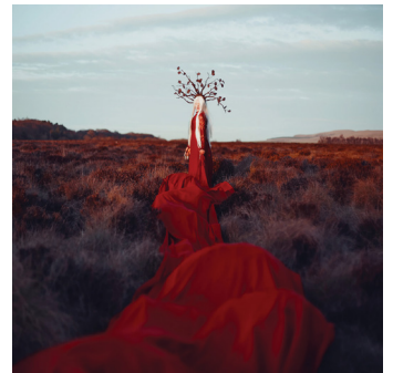
The Eastern Scrolls 2023 Split Album