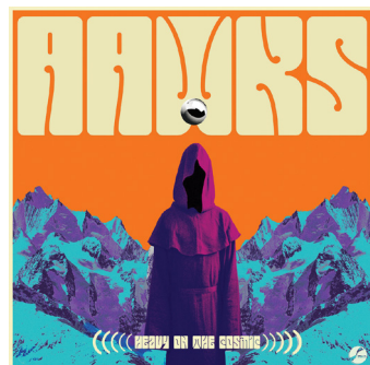
Heavy on the Cosmic 2022 Album