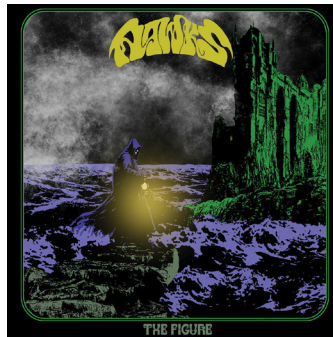
The Figure 2023 Single