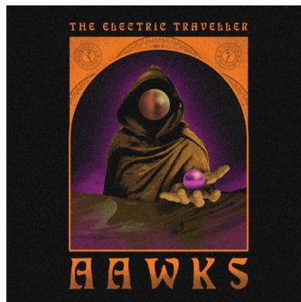
The Electric Traveller 2022 Single