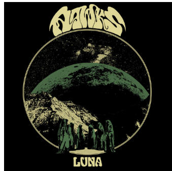
Luna 2023 EP