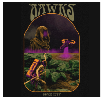
Space City 2022 Single